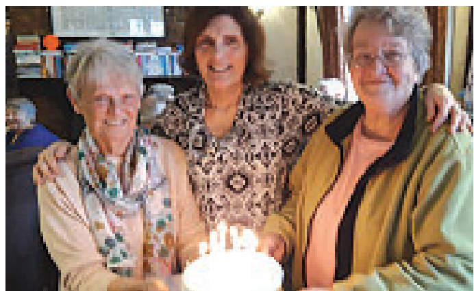
Birthday celebrations for our three volunteers